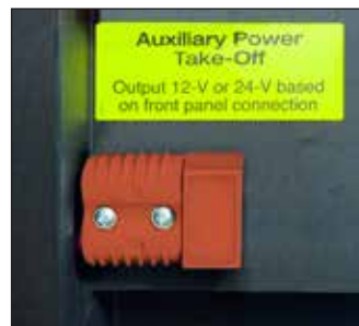
The 5020 has a 175 amp connection for aero cables.